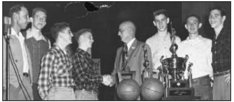
The trophy presentation at West High School.